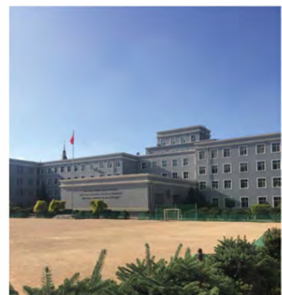
Wanbang School, Harbin China